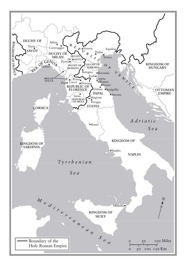
Italy in 1500