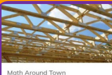
Math Around Town