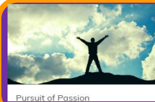
Pursuit of Passion