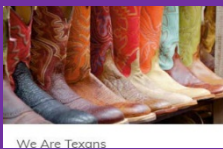
We Are Texans

Social Studies- Exploration and Settlement of Texas