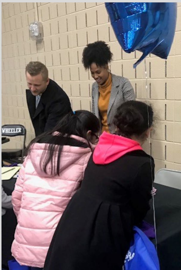
Happy students excited about summer!