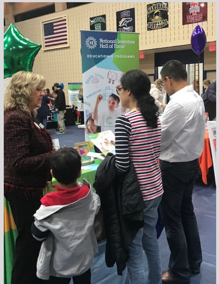
The tables stayed busy throughout the night!