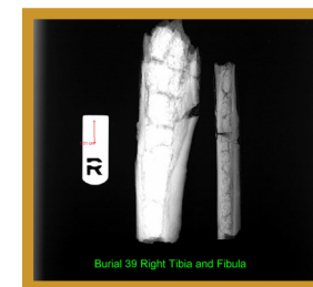
Bone fragments discovered on February 18, 2018.