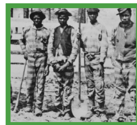
A community member warns about the possibility of graves at site in October 2017.