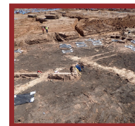
On April 5, 2018 construction was halted. A notice to the County Clerk regarding an abandoned cemetery was filed on April 2, 2018.