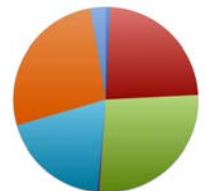
2015 FBISD Ethnicity