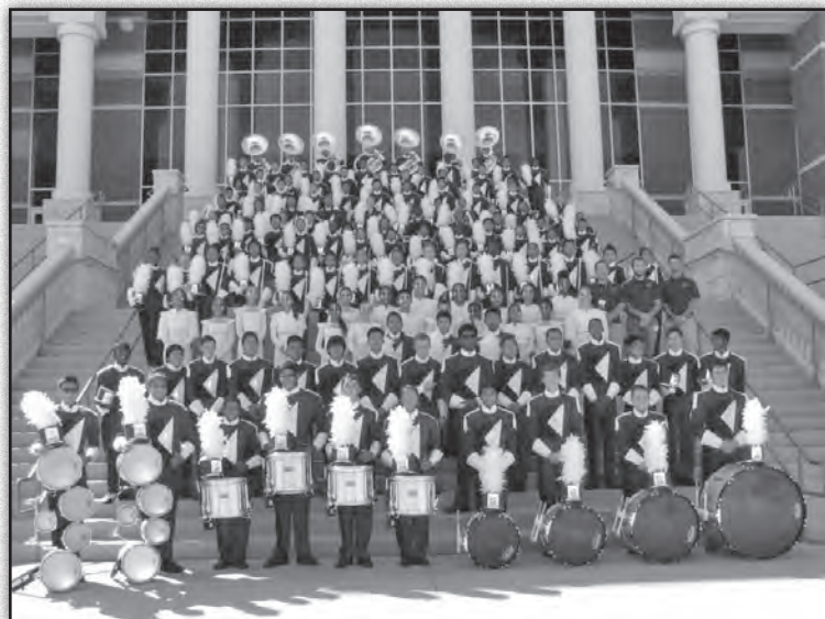
UIL at the Berry Center