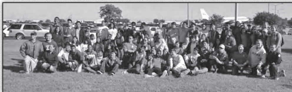
Here are the cadets who volunteered at Wings Over Houston

The drill teams from TX-924 went and competed at the CE King "Salute To Veterans" drill meet November 8th. The teams competed in 10 phases and placed in 8 of these phases. They went on to win the Overall Championship trophy from a field including 20 other high schools. The drill teams will compete again on December 6th at the Bayou Classic drill meet at Willowridge High School.