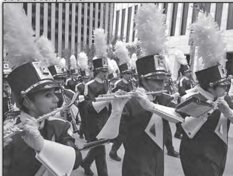
KHS Marching Band participated in the Veterans Day Parade on November 11th