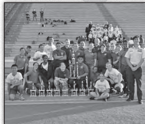
Here are all of the competitors from the CE King Competition.

Kempner Choir Holiday Show December 9th @ 7:00 p.m. KHS Auditorium Admission is FREE!